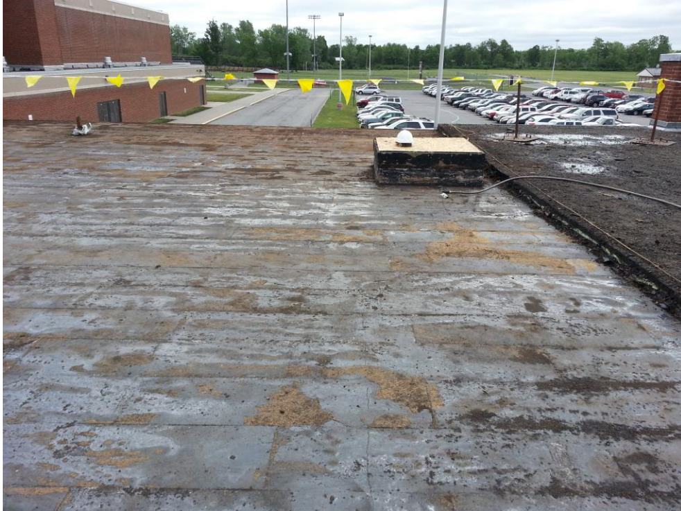
Buildings & Grounds Roof Deck (old roof removed)